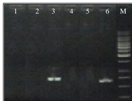
Fig. (1): Amplified PCR fragments produced from using WTGs specific primers (Cp-F & Cp-R and HD1 & HD2). Stressed tomato plants with 100 mM NaCl (lanes 1, 2) showed negative results in case of first couple of primers and lanes (4, 5) showed negative results for second couple of primers compared with the cloned TYLCV genome which was used as positive control (+) lanes (3, 6) and gave the expected molecular weight. Lane M represents the DNA marker (1 KB Ladder from Fermentas).